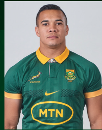
Cheslin KOLBE VIEW BIO