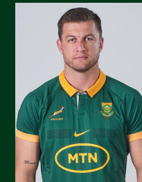
Handre POLLARD VIEW BIO