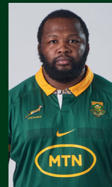
Ox NCHE VIEW BIO