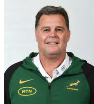
Rassie ERASMUS HEAD COACH