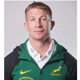
Jerry FLANNERY ASSISTANT COACH