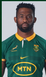
Siya KOLISI VIEW BIO