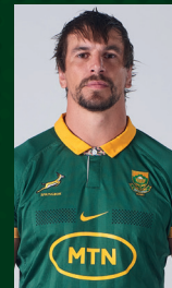
Eben ETZEBETH VIEW BIO